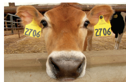
Interesting - Unusual