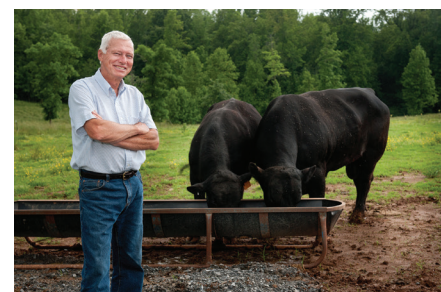
Interesting - Portrait