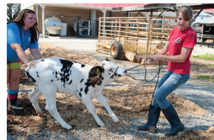
Interesting - Action